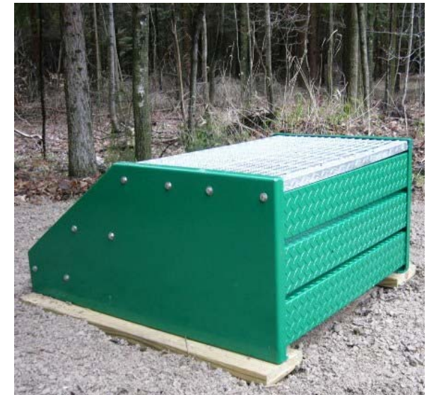
Photo at Machickenee Trail System